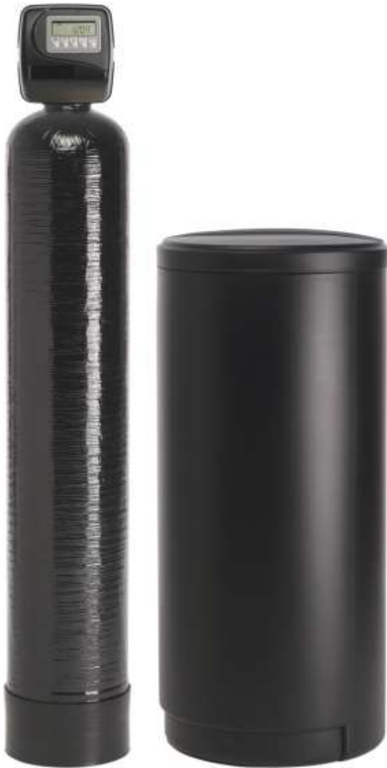
2 Tank Models